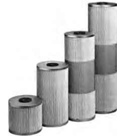
Water Absorbent Aquacon® (Form #1684)