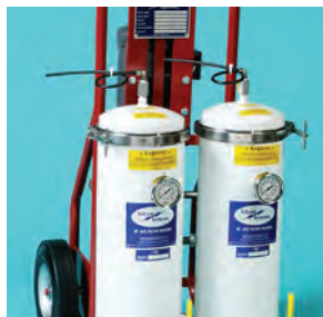
MDP5E (Form #1691)