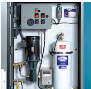
TP2 (Form #1748)