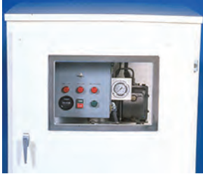
TDS5 (Form #1802)