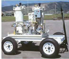
SDS20 (Form #1793)