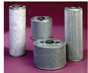
Superdri® Cartridges (Form #1778)