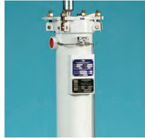
VF8 Series & Vel-Max® (Form #1708 & 1961)