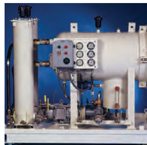
TOC30 (Form #1751)