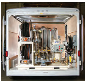
OFT30 (Trailer Mounted)