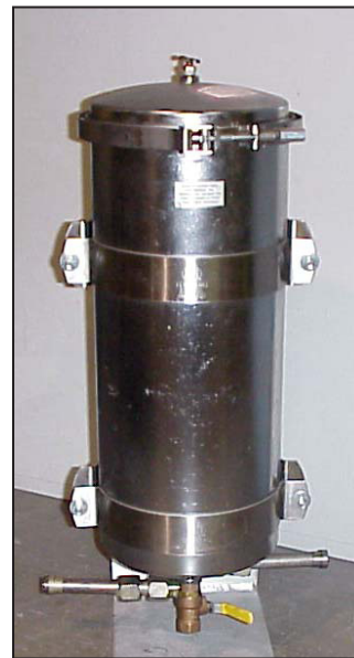
Harvard H1000 Housing