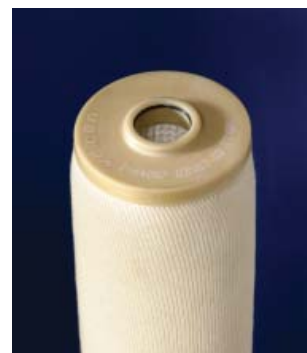
Bottom—Mounting end with O-ring seal