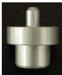
GTP-5935-M Alignment Pin