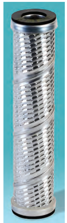
ACA-210 Filter Cartridge