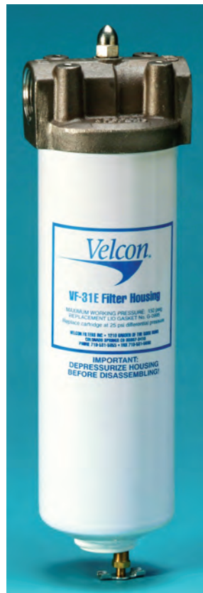
VF-31E Filter Housing

Aquacon Cartridges are also excellent dirt filters. Silt, rust, and other particulates are removed by the cartridge’s outer filter media. One-half, five, and 25 micron rated cartridges are available for use with fuels and oils. The ACA-210 cartridge, for use with compressed air and other gasses, has a 1 micron rating.